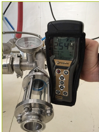
Amount of RLU on contaminated Valve from CIP prior to cleaning.

By testing for ATP (adenosine triphosphate), facilities can determine which surface areas are being cleaned properly or which must be cleaned more thoroughly. Though it may not suit the standards of every facility, a common threshold for ATP is that of less than 100 RLU depending on the monitoring device.